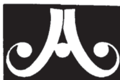
Cover Conté drawing by LANA