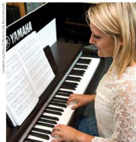
Location courtesy of Music & Life, Bournemouth

“Deciding to take the first step towards discovering your musical talents is worthwhile at any age”